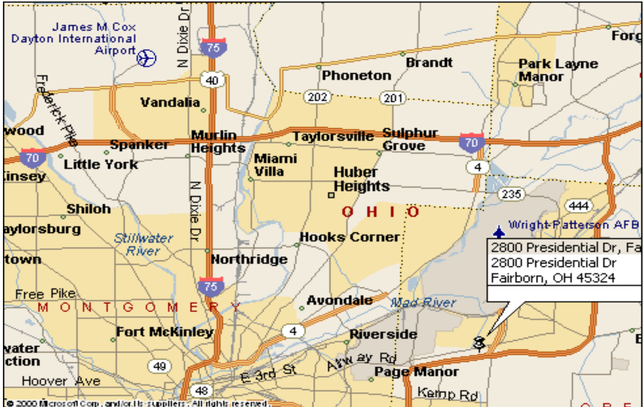
Map of Dayton/Fairborn Area -Dayton International Airport - Wright-Patterson AFB & Museum Holiday Inn, Dayton/Fairborn I-675