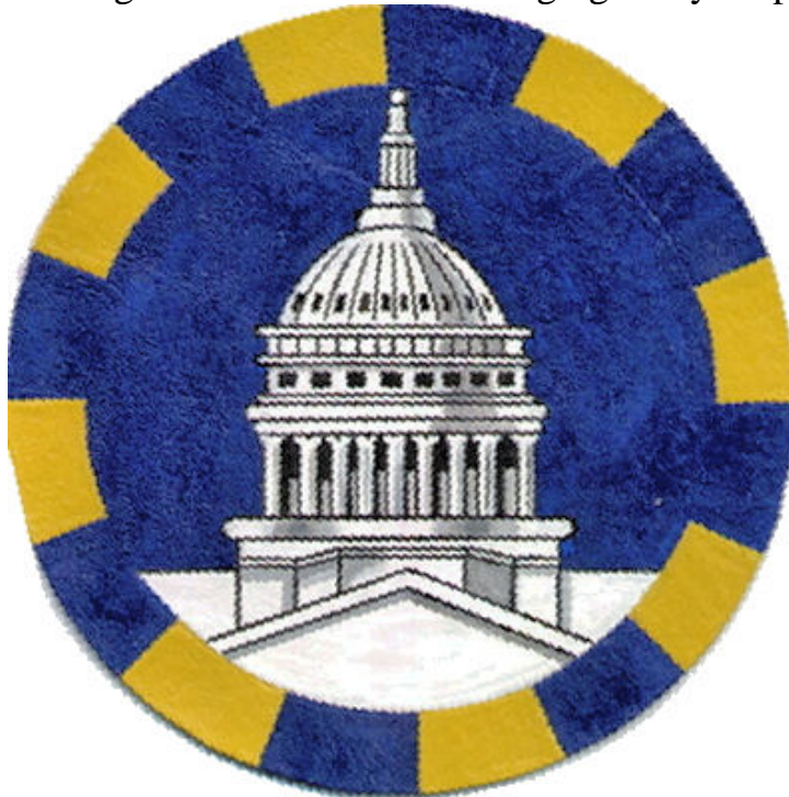
19TH BOMB GROUP 14TH SQUADRON LOGO

On December 22, 1941, their 24th day at sea ended as they docked on the east coast of Australia near Brisbane. Don writes in the diary, "By golly, we can breathe easy tonight. No more running around in the ocean dodging every suspicious cloud."